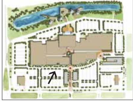
● Location of major vehicle gates to the ITECC Campus

The traditional principal entrance to the property is from Mexico Boulevard. This entrance provides opportunity to introduce the new identity for the ITECC through a revised architectural character to the campus. This entrance will become a promenade with a divided four lane approach. Palm trees will flank the promenade. The drive, paved to provide texture and color, terminates in a landscaped round-about. Depending on future facility needs, the master plan lays out the development of future buildings at either side of the promenade to help the pedestrian scale and enhance the approach to the campus.