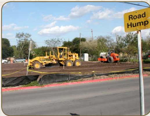
Feb 26: Clearing and grading the ground in preparation for water lines and landscaping forms.