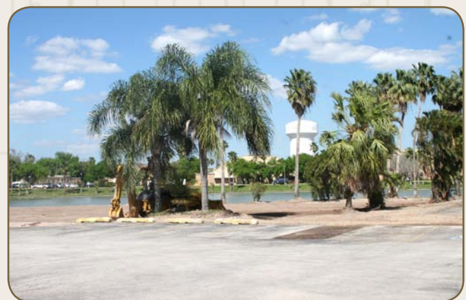
... and further to the right, Garza Gymnasium and the water tower.