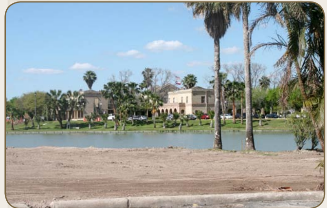
... Champion Hall and Gorgas Hall...