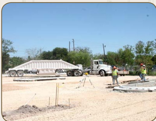
March 12: Now it's time for lots of caliche.