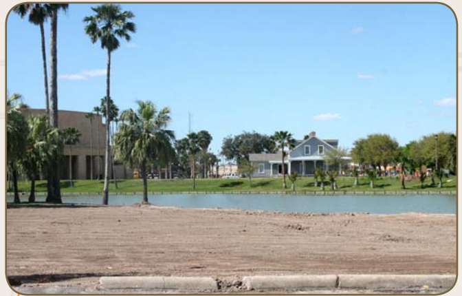
The old Resaca Club parking lot now has a million-dollar view, left to right: The Arts Center and the Commandant's Quarters ...