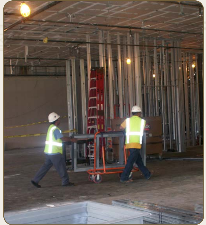
March 10: The new floor plan is now taking shape as wall studs go up in the front area.