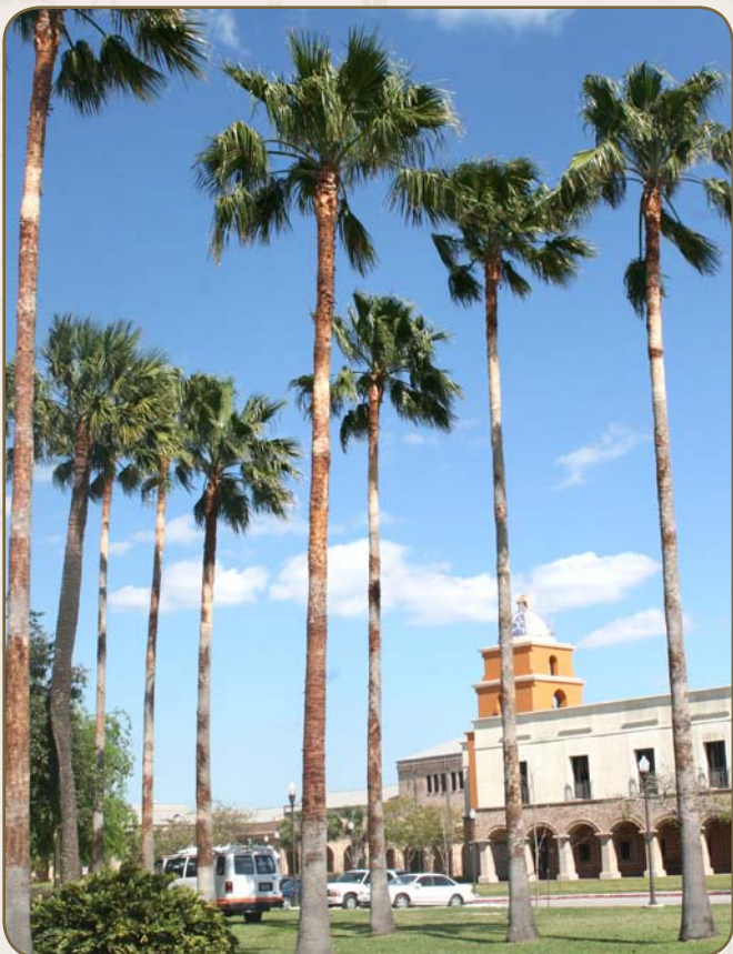
March 17: The end result shown off by a beautiful Brownsville sky.