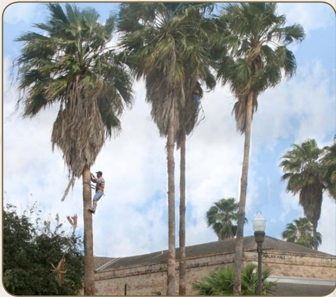
March 15: A skilled palm tree trimmer at work.