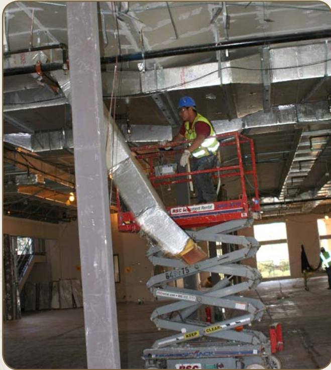
Feb. 5: Early demolition work, including tearing out the old air ducts.